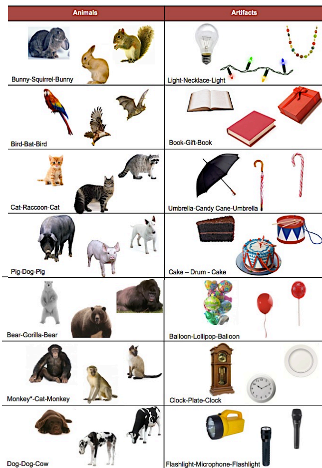
Figure 1. Visual stimuli used in the Property Induction Task. No labels were presented during the task. Each triad includes a target (center), category match (left) and a perceptual match (right). *Note. 'Monkey' is a common label that children apply to this item and was therefore counted as a 'correct' response.

On every trial children were told that the target object had a particular property. All properties were one-syllable blank predicates chosen from the NOUN database (e.g., fisp , wilp , etc.; Horst, 2009). Then, the children were asked to generalize the target property to one of the test items (i.e., the category match or the perceptual match). For the animal triads children were told that the target item possessed an internal pseudo-biological property (e.g., "This one has fisp cells inside") and they were asked to generalize the property to one of the test items. For the artifact triads children were told what the target object was made of (e.g., "This one is made of fupp ") and asked to generalize the property to one of the test items. The screen location of the test items was counterbalanced and the trials were presented in one of two orders: In Order 1 the trials were randomized. For Order 2 the presentation order was simply reversed. Presentation order was counterbalanced across participants.