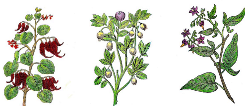
Figure 1: Drawings of the three plants (from left to right: agueroot, bilberry, nightshade) used as the visual stimuli.

Objects The visual stimuli were colored vintage drawings of three relatively obscure plants: an agueroot, a bilberry and a nightshade (Fig.1).