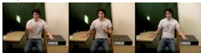
Figure 1: Experimental conditions (from left to right) Right Hand Gesturing, Left Hand Gesturing, No Gesturing.

their free hand during the description (gesture encouragement instruction followed the paradigm in Chu & Kita, 2011). Participants were debriefed about the purpose of the hands immobilization after the experiment and the permission to use the data was allowed. Order of stimuli (forward - reverse), and order of hand(s) prohibition was counterbalanced across participants in a within-participants design.