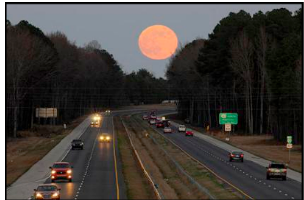
Figure 2: Example of the Moon illusion.

to account for this appearance: illusion and optical phenomenon. Whereas it could of course be the case that a traveler starts to hallucinate an oasis, mirages are properly explained (and most frequently happen) by the bending of light rays from distant objects and can be captured on camera - thus they are optical phenomena. The moon illusion, on the other hand, is a phenomenon that often occurs when people look at the moon which is just above the horizon. The moon appears to be larger on the horizon than it is high up in the sky (see figure 2 below). It was originally thought that due to light refraction in the atmosphere, the moon on the horizon occupies more space in the visual field than it would normally do. However, the moon illusion is not an optical phenomenon but is explained by the workings of our perceptual apparatus and is related to the Ponzo illusion, and cannot be captured on a photograph.