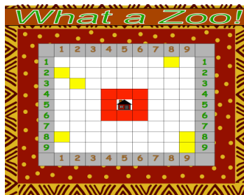
Figure 1: Schematic depiction of the semantic space game board. Red squares mark the location of critical trials; yellow squares mark the location of filler trials. Note that none of the locations were colored when the task proper was administered.

Children’s score on the semantic space task was calculated by averaging habitat dyads and unrelated dyads together in order to create a composite score for non-semantically-similar dyads. Next, the average score for semantically-similar dyads was subtracted from the non semantically-similar composite score to obtain a difference score. Difference scores approaching zero indicate that children did not differentiate the placement of semantically-similar and dissimilar dyads. Difference scores above zero indicate that children placed semantically-similar dyads closer than dissimilar dyads. The semantic space task was administered at Time1 and Time2.