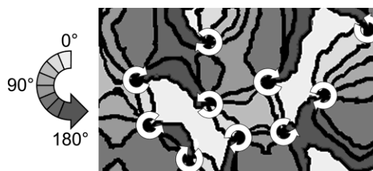
Figure 2. Cortical realizations of frame attributes. Fragment (ca. 4mm 2 ) of the neural feature map for the attribute orientation of cat V1 (adapted from Crair et. al., 1997). The arrows indicate the polar topology of the orientation values represented within each hypercolumn. Hypercolumns are arranged in a retinotopic topology.

For many attributes involved in perceptual processing one can anatomically identify cortical correlates. Those areas often exhibit a twofold topological structure and justify the notion of a feature map: (i) a receptor topology (e.g., retinotopy in vision, somatotopy in touch): neighboring regions of neurons code for neighboring regions of the receptive field; and (ii) a feature topology: neighboring regions of neurons code for similar features (See Figure 2). With regard to the monkey, more than 30 cortical areas forming feature maps are experimentally known for vision alone (Felleman & van Essen, 1991). Also affordance attributes seem to have cortical correlates, predominantly in the premotor cortex. The discovery of the so-called mirror neuron system (Rizzolatti, & Craighero, 2004, for review) may provide a basis to integrate affordances into frames.