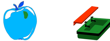
Figure 1: Picture stimuli used in Experiments 1 and 2. See explanation in the text.