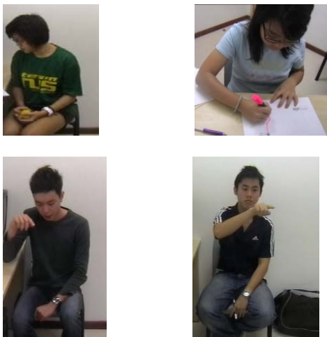
Figure 2. Mental practice (MP, top left), physical practice on paper (PP on paper, top right), physical practice in air while keeping eyes closed (PP in air with eyes closed, bottom left), and physical practice in air while keeping eyes open (PP in air with eyes open, bottom right).

After finishing drawing the route of the first map, the participants entered rehearsal phase. The procedures in this phase were different across the conditions. Figure 2 shows what the participants did in the four conditions. In the MP condition, the participants were asked to hold a softball (hence, that their finger movements were restricted) and given 20 1 seconds to mentally rehearse the route. In the PP on paper condition, the participants were given an empty map (i.e., a map without the vertical lines and strokes) and asked to draw the routes from the starting points to the destinations. In the PP in air with eyes closed condition, the participants were asked to close their eyes and use the index fingers of their preferred hands to draw the routes in air. In the PP condition with eyes open, the participants opened their eyes while drawing the routes with their index fingers of the preferred hands in air.