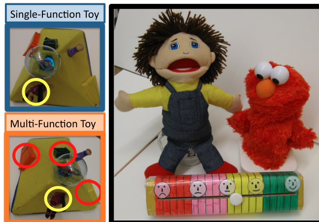
Figure 1: Stimuli used in Experiments 1 and 2.

In Experiment 1, adult participants explored one of two perceptually identical toys that differed only in whether they had only a single function (Single-Function Toy condition) or multiple (four) functions (Multi-Function Toy condition).