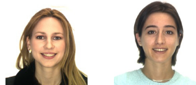
Figure 1: Example of habituation and novel face stimuli (from Martinez & Benavente, 1998)

support sat in a Bumbo® placed on the caregivers lap. Caregivers wore shaded glasses and earphones playing music so that they could not see the pictures or hear infants' vocal reaction. A Cannon GL camera placed directly in front of infants was used to capture a zoomed-in frontal view of infants' faces. (See Figure 3.)