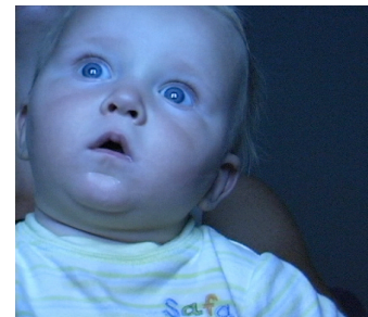
Figure 3: Infant participant orienting attentively to stimulus image. Even though infant has shifted away from the center of the camera field and twisted her body, the stimulus image is clearly reflected (as a white box) in the center of her cornea.