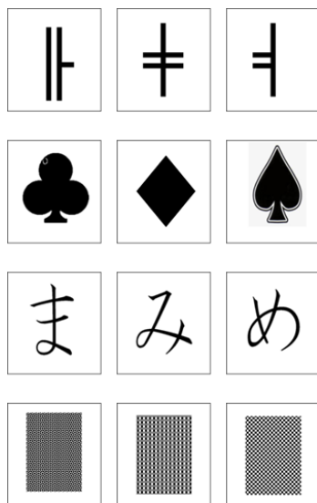
Figure 1: Stimuli used for categorisation task. Each row represents a set of cues.

Participants were told that they would be predicting the weather based on a set of tarot cards. They were told that although they might need to guess at the start, they would