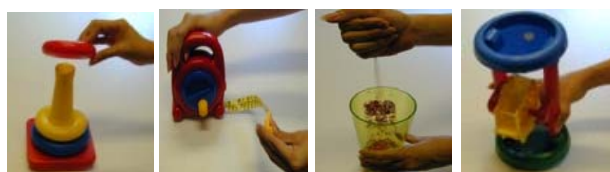
Figure 1: Actions and stimuli used for Experiment 1.