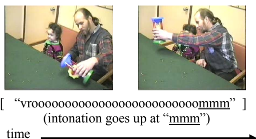
Figure 2: Examples of sound synchronies (using standard lexical items)

Intonation contours in time with action contours Examples: as one spin a sand toy against a table, he/she says “vroom” by adding intonation at the end as to differentiate/mark the end of the action.